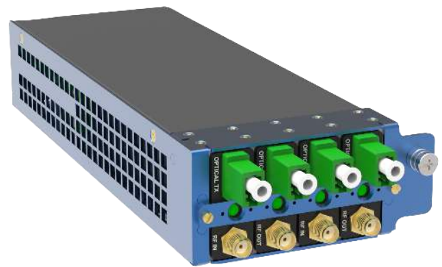
J84 PLUG-IN MODULE