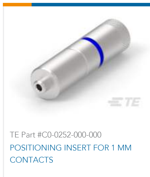
TE Part #C0-0252-000-000 POSITIONING INSERT FOR 1 MM CONTACTS