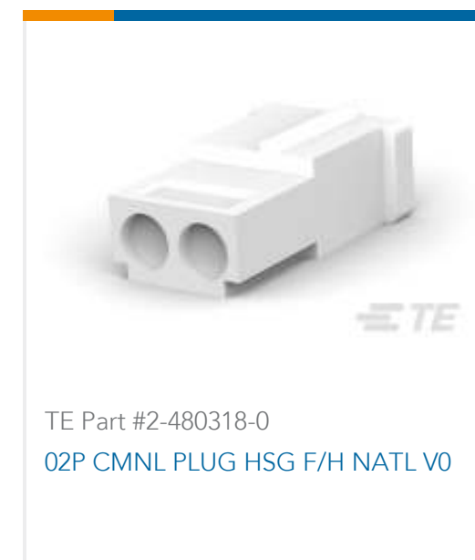
TE Part #2-480318-0 02P CMNL PLUG HSG F/H NATL V0