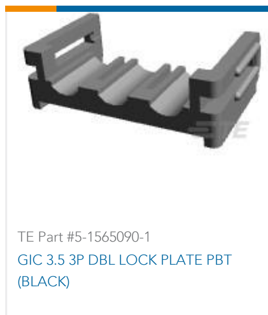
TE Part #5-1565090-1 GIC 3.5 3P DBL LOCK PLATE PBT (BLACK)