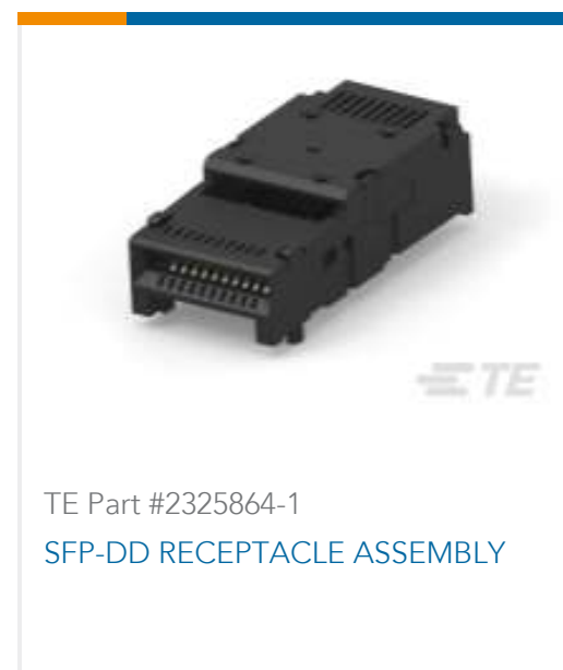
TE Part #2325864-1 SFP-DD RECEPTACLE ASSEMBLY