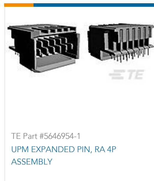
TE Part #5646954-1 UPM EXPANDED PIN, RA 4P ASSEMBLY