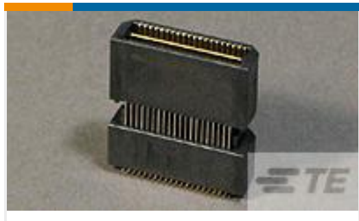
TE Part # 1-1658018-1 MSB0.80PL22ASY28DP,-,10,VCTY