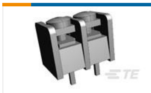
TE Part #2-1437667-4 4DB-P108-02=4DB ASSEMBLY