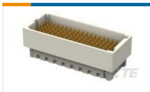
TE Part #2102060-1 Mezalok, Pin, 114 p, 50 Au, TL