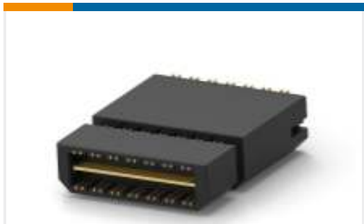
TE Part # 1-1658019-1 MSB0.80PL25ASY28DP,-,10,VCTY