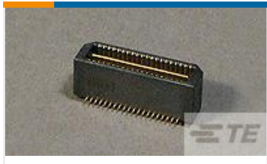
TE Part # 1-1658014-1 MSB0.80PL8ASY28DP,-,10,VCTY