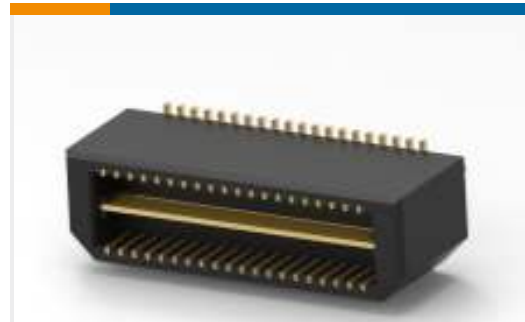
TE Part # 1-1658020-1 MSB0.80PL30ASY28DP,-,10,VCTY