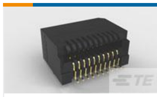
TE Part #1367073-1 20 POS SMT CONN, SFP, 15AU