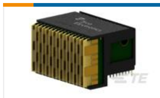
TE Part #1410187-3 MULTIGIG RT T2 7RW DC DF CT