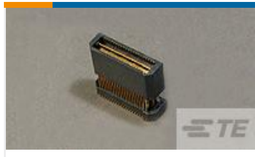
TE Part # 1-1658017-1 MSB0.80PL19ASY28DP,-,10,VCTY