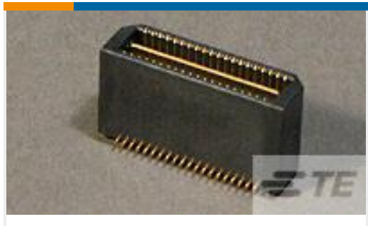
TE Part # 1-1658015-1 MSB0.80PL11ASY28DP,-,10,VCTY