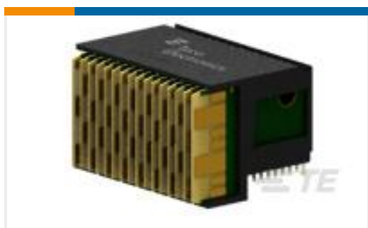
TE Part #1410188-3 MULTIGIG RT T2 7RW DC DF F-RGT