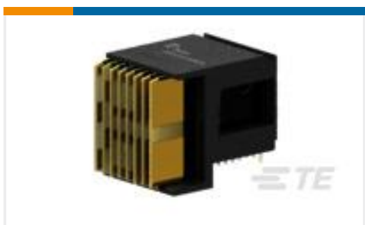
TE Part #1410189-3 MULTIGIG RT T2 7RW H-LFT,ET2