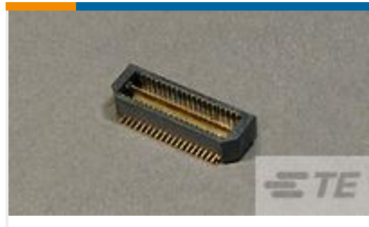
TE Part # 1-1658013-1 MSB0.80PL5ASY28DP,-,10,VCTY