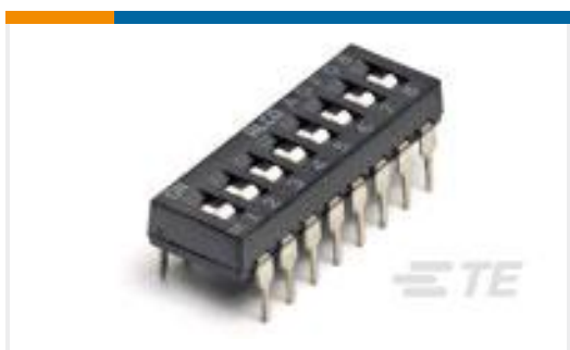
TE Part #1825059-6 ADF02STTR04=DIP S,FLUSH,SMT-GW