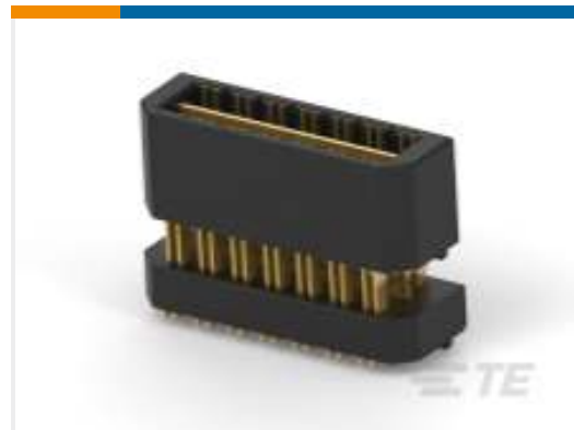
TE Part # 1-1658438-1 MSB0.80PL14ASY28DP,-,10,VCTY