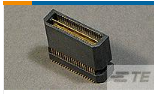
TE Part # 1-1658016-1 MSB0.80PL16ASY28DP,-,10,VCTY