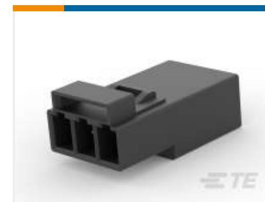
TE Part #2834055-2 REC, 3P LATCHED POKE-IN WTW CONN.BK