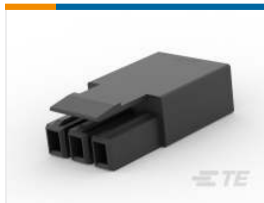
TE Part # 2834054-2 PLUG, 3P LATCHED POKE-IN WTW CONN.BK