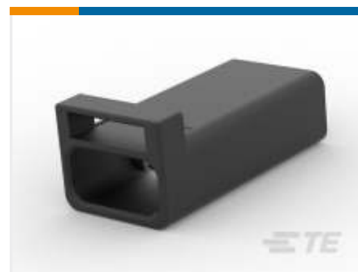
TE Part #2-2834075-3 3P REC, MINIATURE WATERPROOF CONN,BLACK