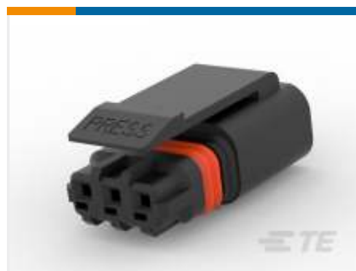
TE Part #2-2834074-3 3P PLUG, MINIATURE WATERPROOF CONN,BLACK