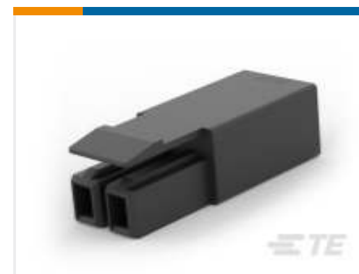
TE Part #2834048-2 LIGHT-N-LOK Modular Latched Plugs