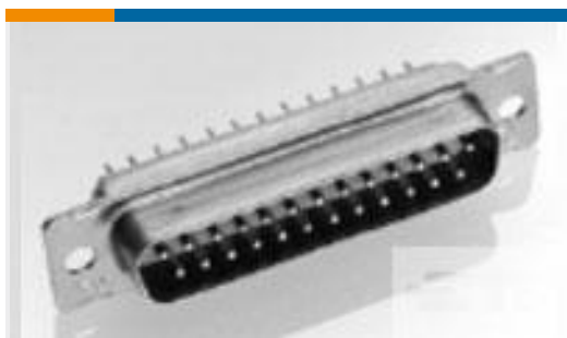
TE Part #204505-1 AMPLIMITE,ASY,PLUG,STD,90,3