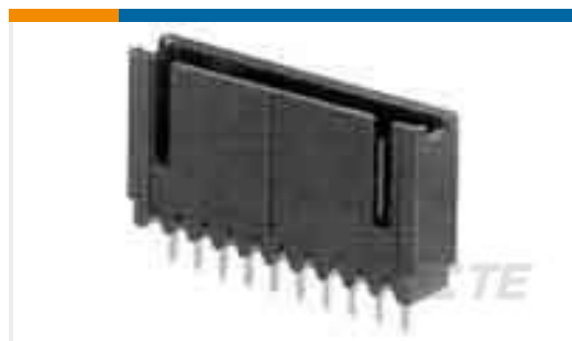
TE Part #5-103080-2 04 MODII HDR SRST SHRD .100CL