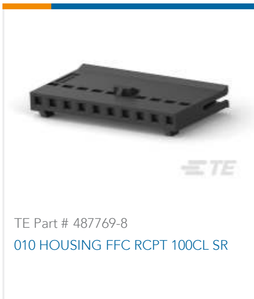
TE Part # 487769-8 010 HOUSING FFC RCPT 100CL SR