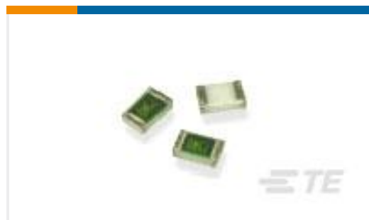
TE Part #9-1625868-4 RP 2A 0.25W 49R9 0.1% 25PPM 1K RL