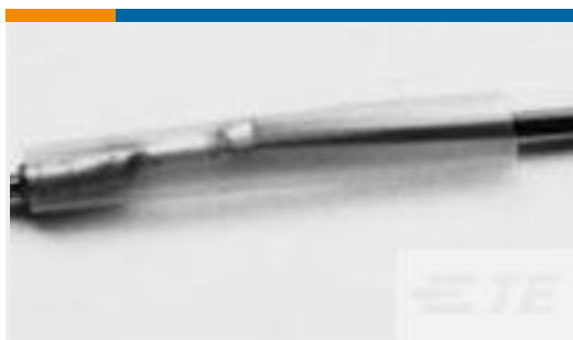
TE Part #CV3309-000 RW-175-1-1/2-X-STK