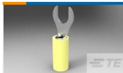
TE Part #2-323011-2 TERMINAL,PIDG R SLTD 26-22 6