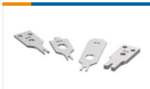
TE Part #8-1633738-5 CRIMPER, WIRE F