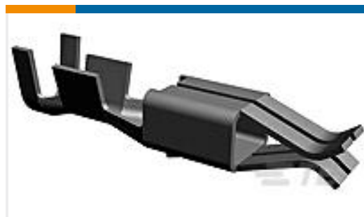
TE Part #927845-1 JPT SL REC 2.8 Contact SRC Sn