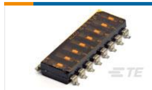
TE Part #1-1825006-6 GDS08STR04=DIP SW,SLIDE,SMT,TR