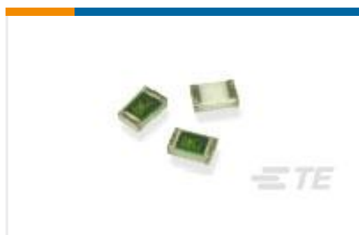
TE Part #8-2176089-5 RP 1J 0.166W 88K7 0.1% 25PPM 1K RL