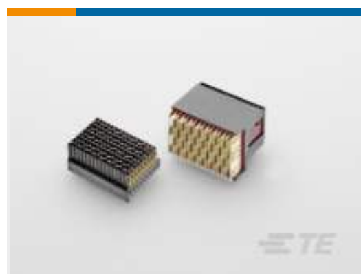
TE Part #2313237-2 RAPLUGASSY, MGRT3, POWER, DP, SE, CENTER