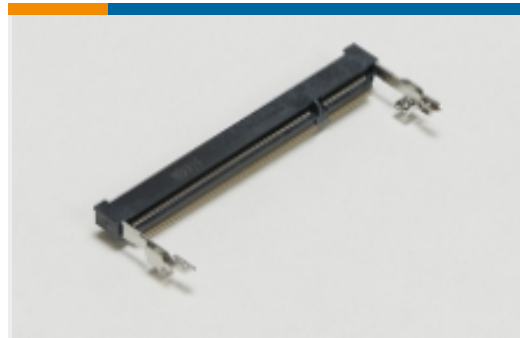
SO DIMM Sockets(39)