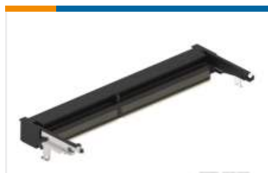
TE Part #2309411-1 DDR4 SODIMM 260P 8.0H STD