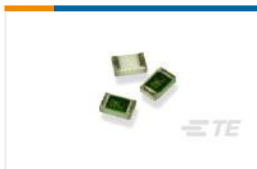
TE Part #8-1879338-2 CPF 0603 187K 1% 50PPM 1K RL