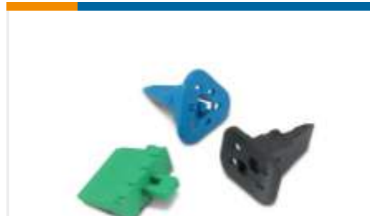
TE Part #W2S Wedgelocks: DEUTSCH DT