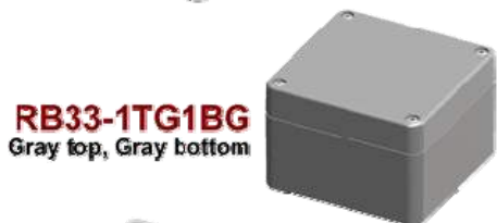
RB33-1TG1BG Gray top, Gray bottom