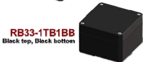
RB33-1TB1BB Black top, Black bottom