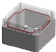
RB33-1TC1BG Clear top, Gray bottom

Size: 3.22" X 3.15" X 2.17" 82mm X 80mm X 55mm