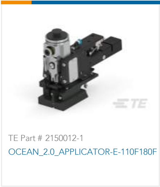
TE Part # 2150012-1 OCEAN_2.0_APPLICATOR-E-110F180F