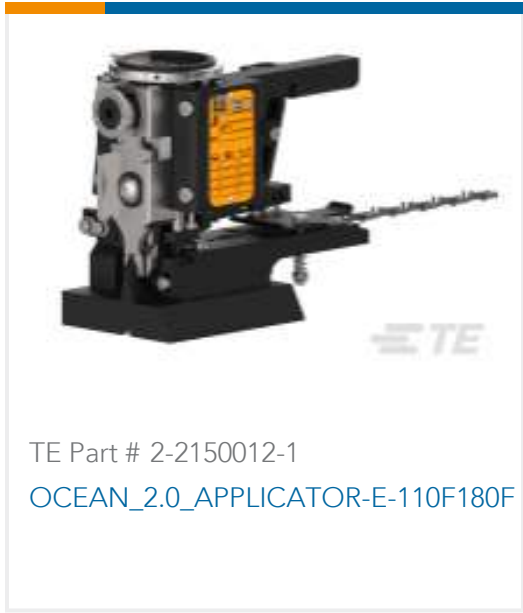
TE Part # 2-2150012-1 OCEAN_2.0_APPLICATOR-E-110F180F