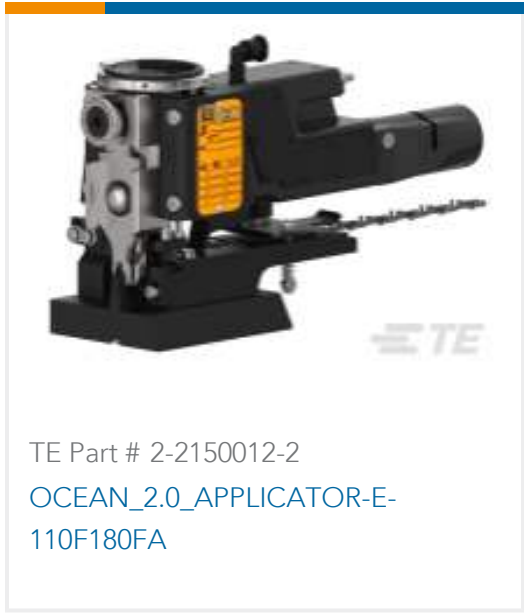
TE Part # 2-2150012-2 OCEAN_2.0_APPLICATOR-E-110F180FA