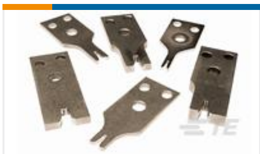
TE Part #4-456406-3 CRIMPER WIRE .090 "F"