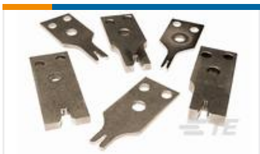
TE Part #5-456406-6 CRIMPER, WIRE .090 "F"