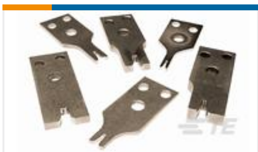
TE Part #2119582-2 Crimper, Insulation F Premium