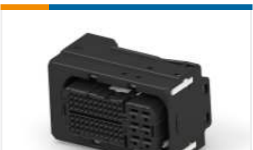
TE Part #2304106-1 PLUG ASSEMBLY 72P