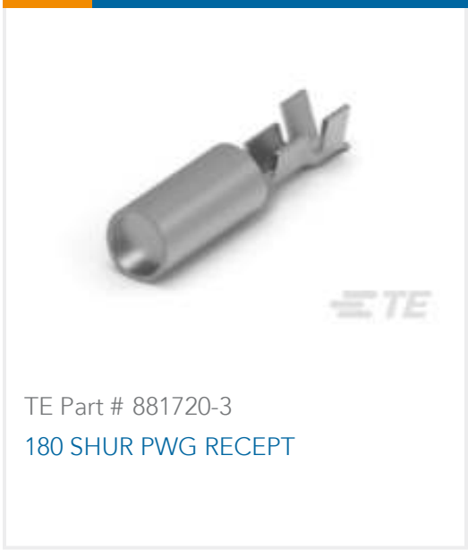
TE Part # 881720-3 180 SHUR PWG RECEIPT