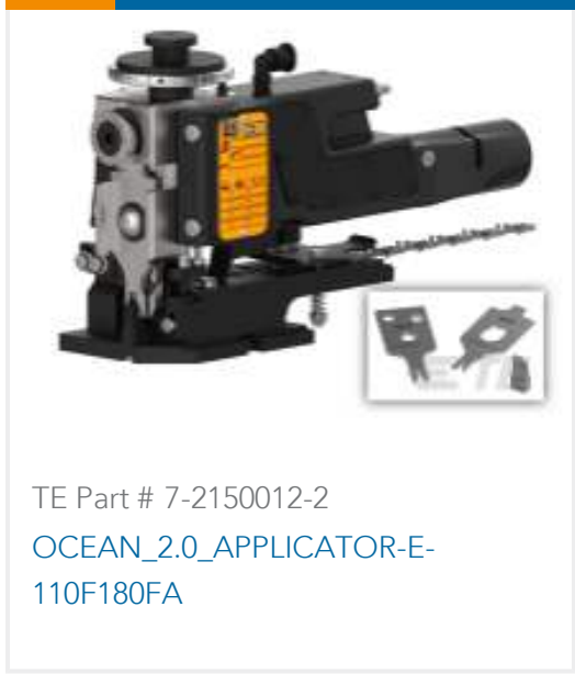
TE Part # 7-2150012-2 OCEAN_2.0_APPLICATOR-E-110F180FA