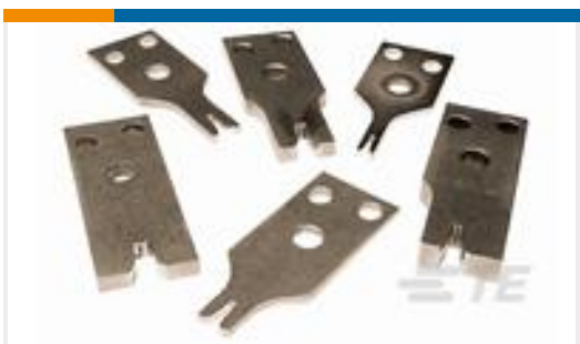
TE Part #6-683454-5 CRIMPER, INSULATION, "O"