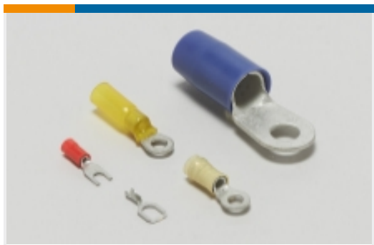
Ring Terminals & Spade Terminals(6)