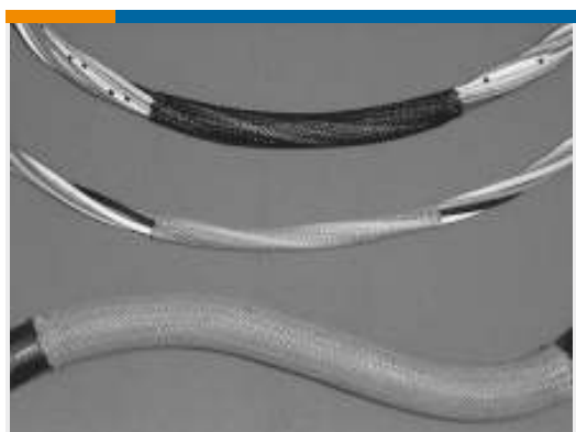
TE Part #CH02064001 VERSAFLEX-1-1/4-0-SP