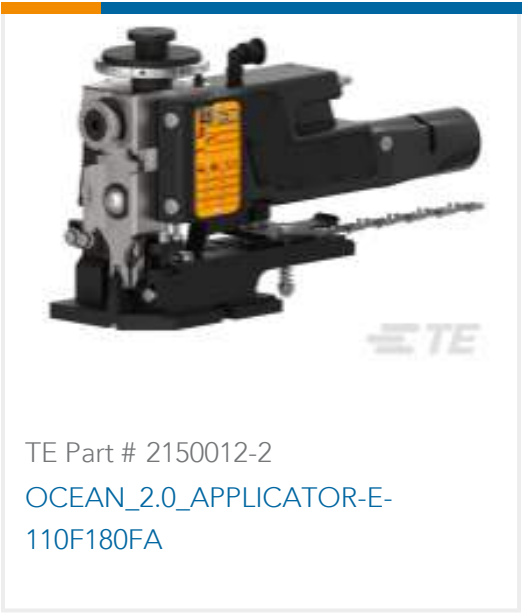
TE Part # 2150012-2 OCEAN_2.0_APPLICATOR-E-110F180FA