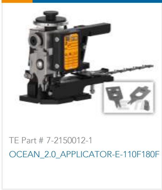
TE Part # 7-2150012-1 OCEAN_2.0_APPLICATOR-E-110F180F