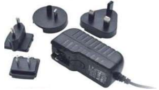
*Product images are for illustrative purposes only and may vary from actual design.