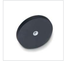
Ansicht auf Haftfläche