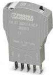
Electronic device circuit breaker, 1-pos., active current limitation, 1 N/C contact, plug for base element.

Please be informed that the data shown in this PDF Document is generated from our Online Catalog. Please find the complete data in the user's documentation. Our General Terms of Use for Downloads are valid ( http://download.phoenixcontact.com )