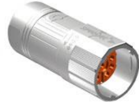
Contact Arrangement mating view