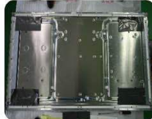
TV LED Unit