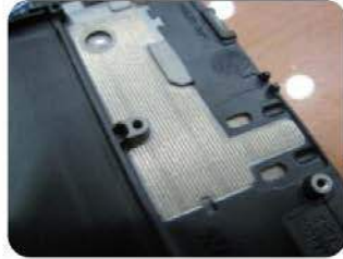
Mobile Middle Case