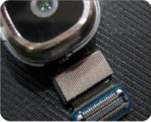
Mobile Camera Module