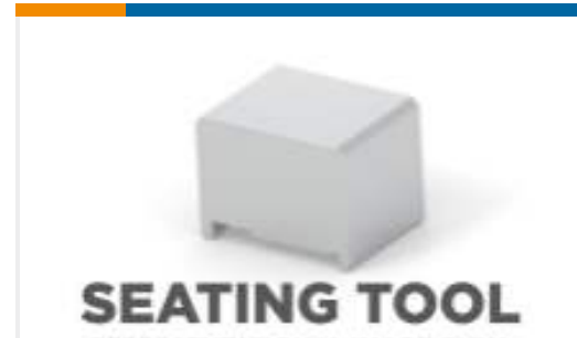
TE Part # 2018513-1 TL, SEAT 4 PR 16 COL BP CONN