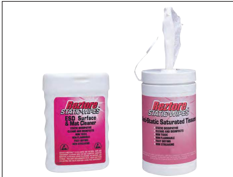
Figure 1. Reztore™ Static-Wipes: 60 Wipes in an Anti-Static Canister 160 Wipes in an Anti-Static Canister