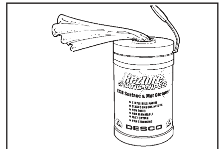
Figure 2. When separating a tissue, tear at an angle.

Lift the container cover from the canister and remove the seal from the lip of the container. Locate the first wipe in the center of the roll of wipes. Feed and push the first wipe through the hole in the center of the top cover and firmly re-attach the cover to the canister.