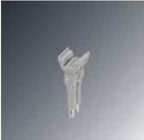
Plug-in bridge, Number of positions: 2, Color: red

Please be informed that the data shown in this PDF Document is generated from our Online Catalog. Please find the complete data in the user's documentation. Our General Terms of Use for Downloads are valid ( http://phoenixcontact.com/download )