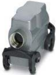
HEAVYCON B16 sleeve housing, with double locking latch, height: 72 mm, with 1 x M25 gland, lateral cable outlet

Please be informed that the data shown in this PDF Document is generated from our Online Catalog. Please find the complete data in the user's documentation. Our General Terms of Use for Downloads are valid ( http://download.phoenixcontact.com )