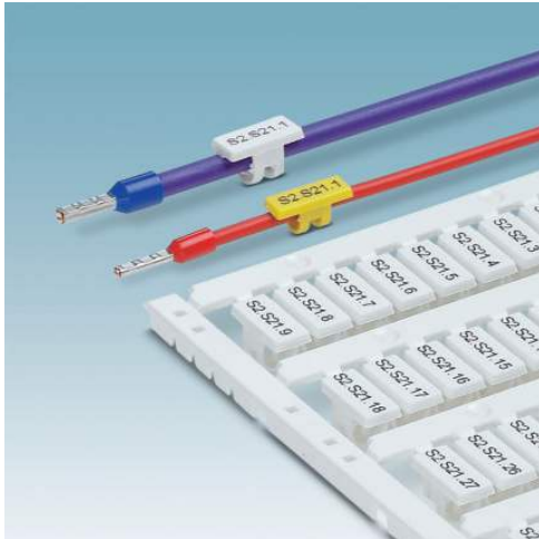
Figure may contain other products.