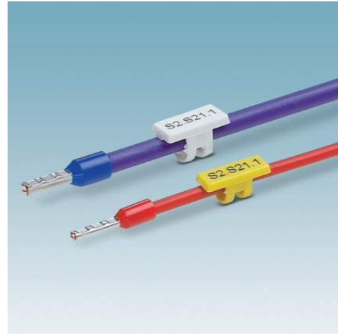
Figure may contain other products.