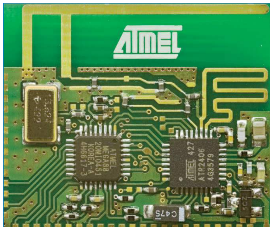
ISM Reference Design