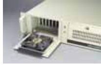
Figure 2-2: Cooling fan & filter

Refer Figure 2.2 to find location of system cooling fan and filter. Please replace system cooling fan if it is defective; replace or clearing filter when the dust is too heavy.