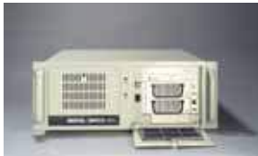
Figure 2.1: Front panel section

Refer Figure 2.1 to find system power LED and HDD LED on front bezel; power switch and system reset which are behind the door.