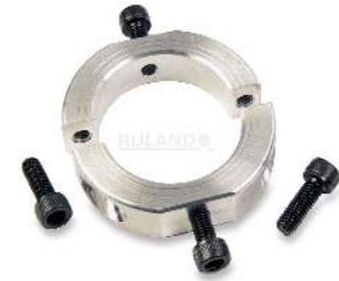
*Additional hardware NOT included