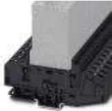
Modular socket element, 2-position, for holding two circuit breakers, each with a single position

Box mounting base - TMCP SOCKET M - 0916589