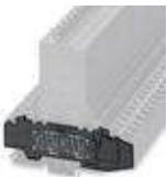
End cover, Length: 115 mm, Width: 6 mm, Color: black