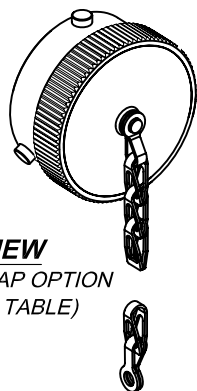
ISO VIEW (FOR DUST CAP OPTION REFER TO TABLE)