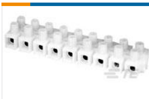
TE Part #1-1776313-2 TSB200012DS=EUROPA T-BL,14.5MM