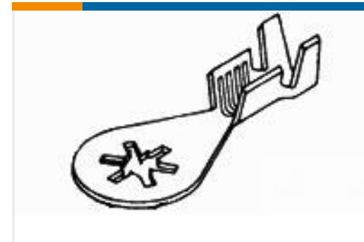
TE Part #640052-1 RING 18-14 AWG SST