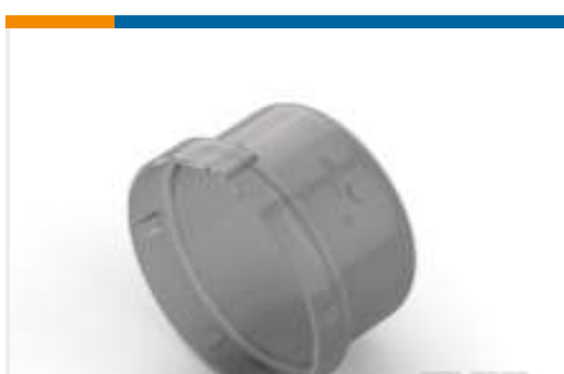
TE Part #2359615-2 LUMAWISE ENDURANCE N+ Lt Gray Short Dome