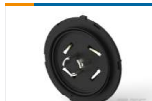
TE Part #2359482-1 LUMAWISE ENDURANCE N+ 7P Base With Vent