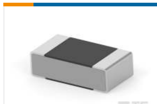
TE Part #7-1879140-6 RN 0603 113K 0.1% 10PPM 5K RL