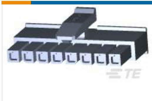
TE Part #1445022-8 MICRO MNL RFECEPT HSG SINGLE R