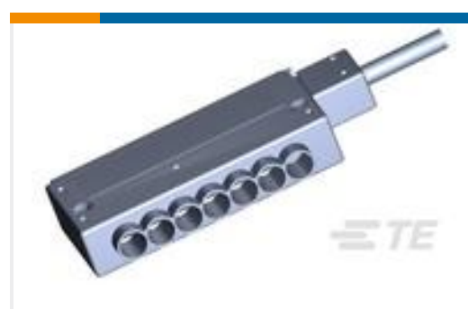
TE Part #1-2083079-1 C/A Nector S Distr to Pigtail LV-2 White