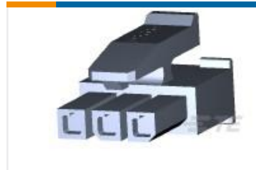
TE Part #1445022-3 MICRO MNL RFECEPT HSG SINGLE R