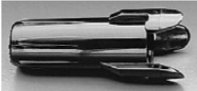
Part Number: 155100-1

155100-1 is only the body of the holder, a component used to form the Twist-Lock In-Line type assemblies . It has no wires, terminals or springs. For a complete holder please use 01550100Z, Universal In-Line Holder.