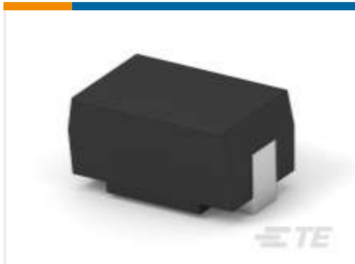
TE Part #7-2176459-7 SMD Power Resistor: 7 Watt, 0.10-500 Ohm