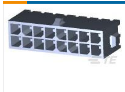
TE Part #4-794632-6 16P MICRO MNL ASSY,VRT,HDR,LF