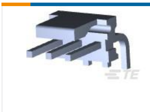
TE Part #3-644761-3 03P MTA156 HDR ASSY R/A F/L LF