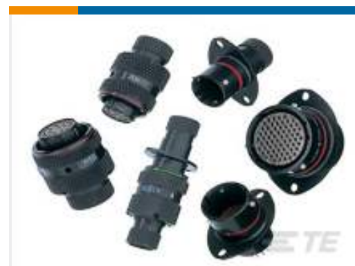
TE Part #AS920 CAP PROT. TYPE 9. #20