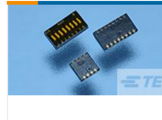
TE Part #1977830-1 DIP SWITCH GDH02SA04