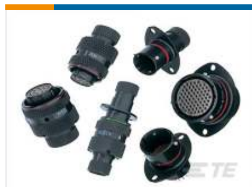
TE Part #AS107-35PA RECEPT. IN LINE TYPE 1 AS MICRO 7