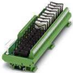
VARIOFACE module, for 16 plug-in miniature relays or miniature optocouplers, with LED, 5 V DC input voltage

Please be informed that the data shown in this PDF Document is generated from our Online Catalog. Please find the complete data in the user's documentation. Our General Terms of Use for Downloads are valid ( http://phoenixcontact.com/download )