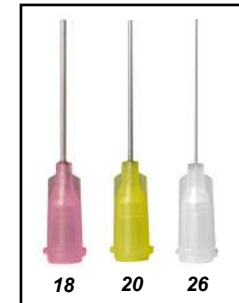
Needle Gauge (GA)