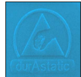
Embossed ESD Logo

Specifications and procedures subject to change without notice. Unless otherwise noted, tolerance is \pm 10\% .