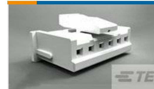
TE Part #1-1969442-1 EP 2.5 TPA Housing, 11 Pos