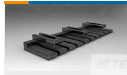
TE Part #1-1969443-1 EP 2.5 TPA Retainer, 11 Pos