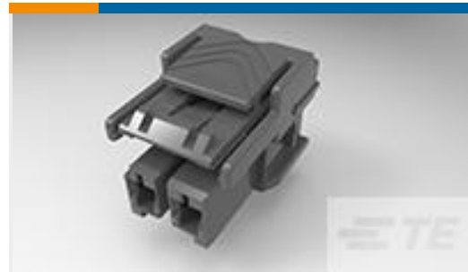
TE Part #5-2232265-2 PTL 1X2 PLUG HSG GLW WIRE KEY A DGR