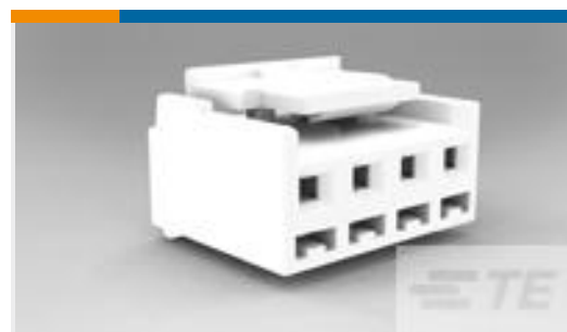
TE Part #2132781-5 05P EP-II HOUSING, NATURAL