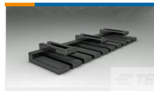
TE Part #1969443-5 EP 2.5 TPA Retainer, 5 Pos