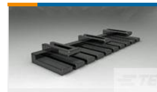
TE Part #1969443-2 EP 2.5 TPA Retainer, 2 Pos