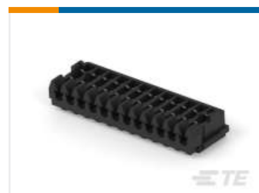
TE Part #3-353293-2 1.5MM CT MT REC ASSY 12P BLACK