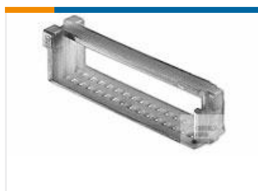
TE Part #2-353294-4 AMP MINI D/R HDR HSG 24P NATU