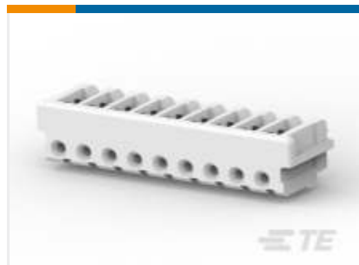
TE Part #173977-7 AMP COMMON TERMINATION HOUSINGS