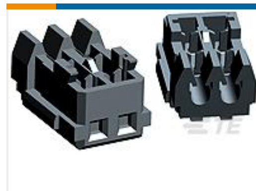
TE Part #353293-6 MINI CT MT REC ASSY 6P GRAY