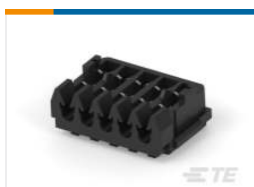
TE Part #2-353293-5 1.5MM CT MT REC ASSY 5P BLACK