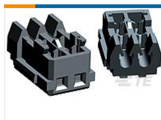
TE Part #1-353293-5 1.5 MINI-CT RECEPTACLE