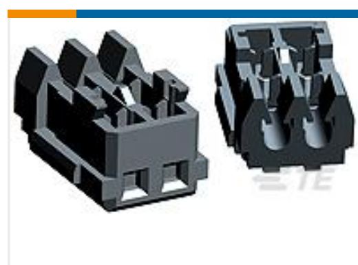
TE Part #1-353293-2 MINI CT MT REC ASSY 12P GRAY