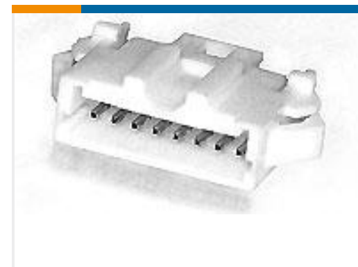
TE Part #292215-6 MINI CT SGL RELAY 6P NAT