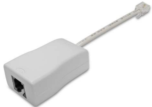
Z-330PJ xDSL over POTS CPE In-Line Filter