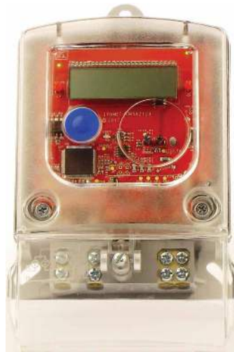
Single-Phase Power Meter