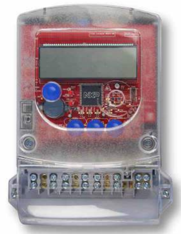
Three-Phase Power Meter