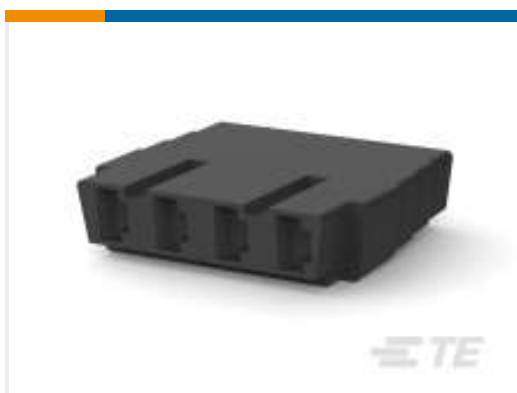
TE Part #926728-1 FF 110 REC HSG 4P NYLON BLACK