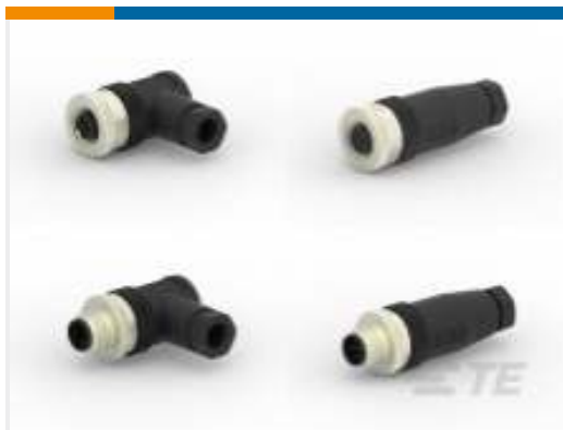
TE Part #T4111001031-000 M12 Field Installable Unshielded