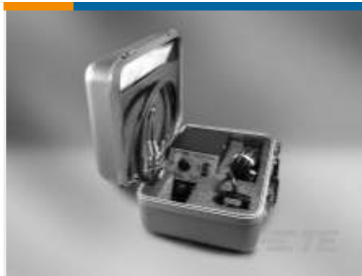
TE Part # 173643-000 RH-3960-1-TINEL-KIT-120V