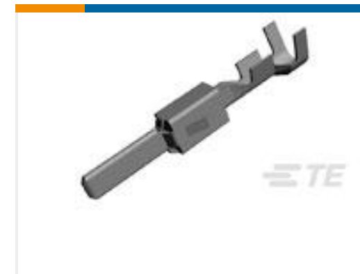
TE Part #1-962915-1 TAB 2.8x0.8 CONTACT CS SWS Sn