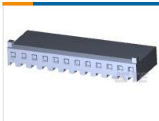
TE Part #1-770849-2 12P SL156 HSG W/LCK RMP & TABS