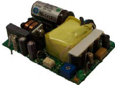
1.66"W x 2.46"L x 0.91"H