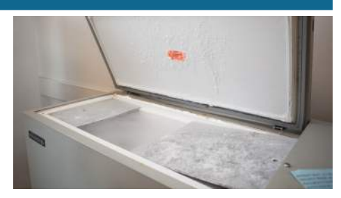
Vaccine & Medical Storage Don't wait until the morning to find out your freezer has stopped running. The WSG30 will e-mail as soon as the temperature rises above a temperature you set.