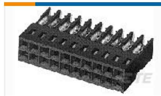
TE Part #1-102398-1 26 AMPMODU MT ASSY DR .100CL