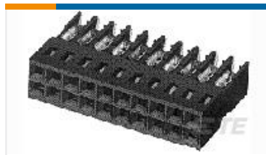
TE Part #5-102398-1 06 AMPMODU MT ASSY DR.100CL SN