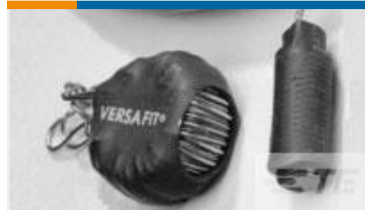
TE Part #F27156-000 VERSAFIT-MINI-SPL-1-BK