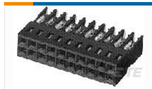
TE Part #5-102398-2 08 AMPMODU MT ASSY DR.100CL SN