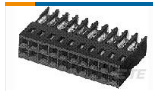
TE Part #5-102398-3 10 AMPMODU MT ASSY DR .100CL