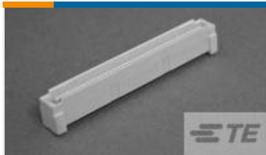
TE Part #5179031-5 0.8FH,P08H.5,120,08/Sn,TU