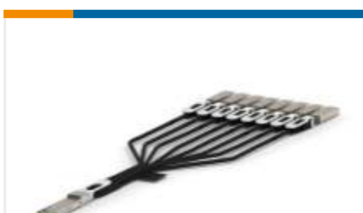
TE Part #2327687-2 DD-8_SFP56, 32AWG, 1.0M