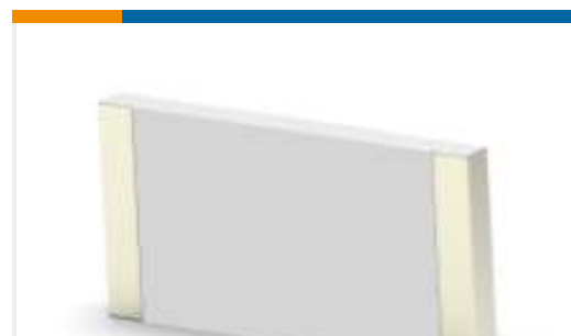
TE Part #2176246-1 CRGS2512 5% 1R0