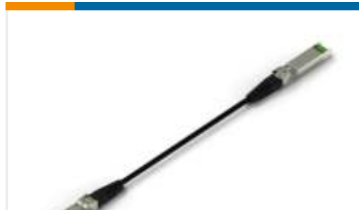
TE Part #4-2821224-5 SFP56 DIRECT ATTACH CA, 3M, 26AWG