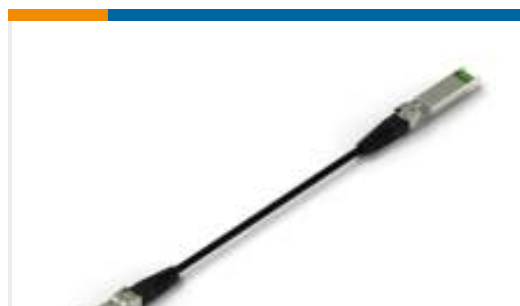
TE Part #4-2334985-2 SFP56 DIRECT ATTACH CA, 1M, 32AWG