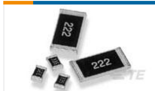
TE Part #1623235-1 CRG0805 1% 47R