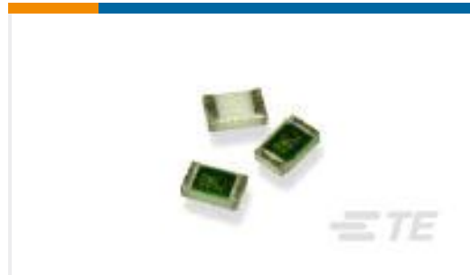
TE Part #7-1614884-7 CPF 0805 5K1 0.1% 25PPM 1K RL