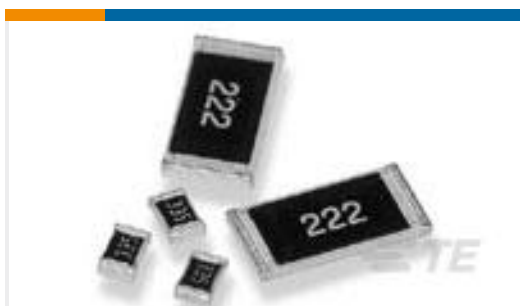
TE Part #1623195-1 CRG0805 1% 330R