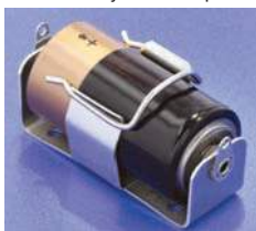
"AA" - "CR2"