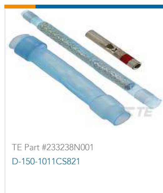
TE Part #233238N001 D-150-1011CS821