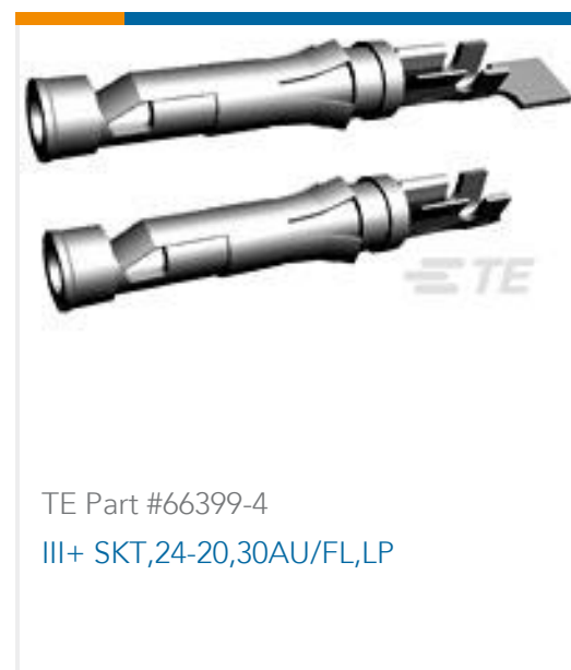
TE Part #66399-4 III+ SKT,24-20,30AU/FL,LP