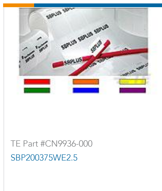
TE Part #CN9936-000 SBP200375WE2.5