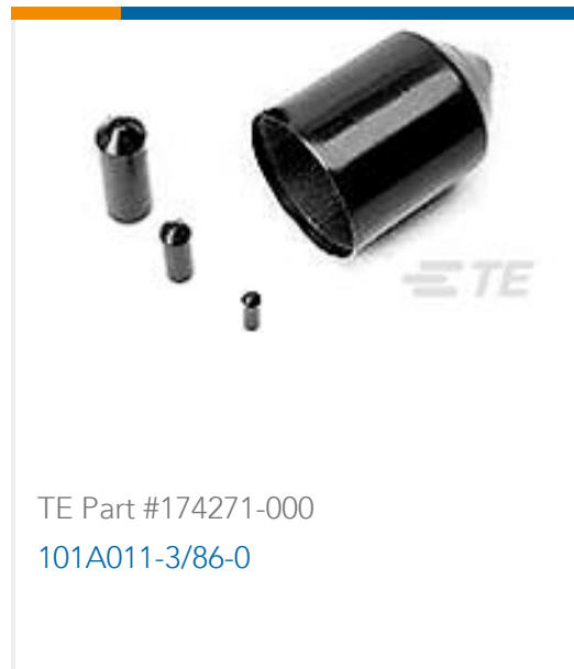
TE Part #174271-000 101A011-3/86-0