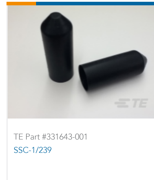
TE Part #331643-001 SSC-1/239