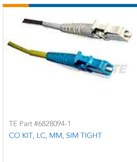
TE Part #6828094-1 CO KIT, LC, MM, SIM TIGHT