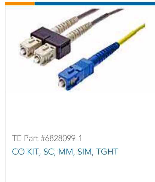
TE Part #6828099-1 CO KIT, SC, MM, SIM, TGHT