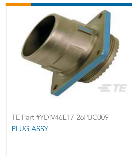
TE Part #YDIV46E17-26PBC009 PLUG ASSY