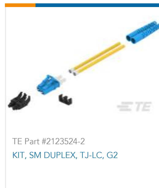
TE Part #2123524-2 KIT, SM DUPLEX, TJ-LC, G2