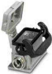
HEAVYCON box mounting base B10, with double locking latch, height 52 mm, with supports 2xM20 and protective cover

Please be informed that the data shown in this PDF Document is generated from our Online Catalog. Please find the complete data in the user's documentation. Our General Terms of Use for Downloads are valid ( http://download.phoenixcontact.com )