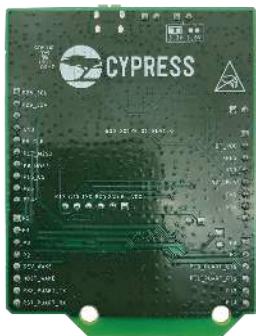
Figure 2: CYBT-243053-EVAL Bottom View