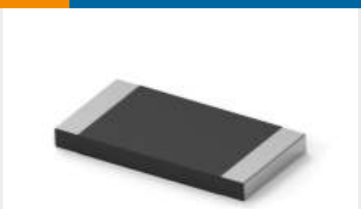
TE Part #1-1879378-1 Metal Chip Resistor: Current Sense