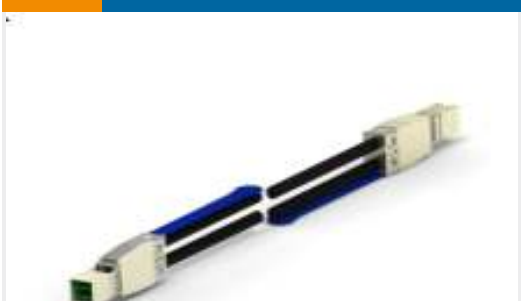
TE Part #2337815-1 MINISAS HD TO MINISAS HD,30AWG, 0.5M