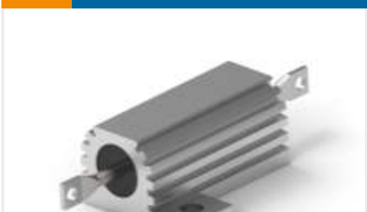
TE Part #2-1879075-9 Power Resistor: Aluminum Housed, 75 Watt