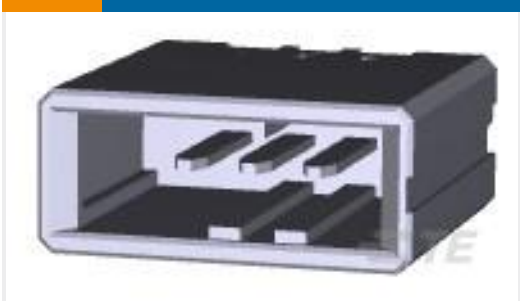
TE Part #1-178313-5 DYNAMIC D3100 HDR V 3P ASSY