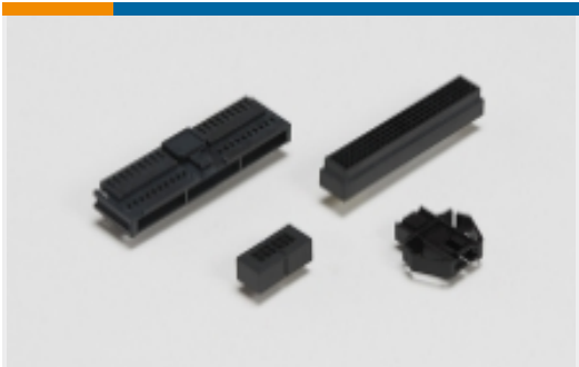
PCB Connector Shrouds(39)