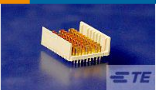
TE Part #6469085-1 HMZD 3PAIR, HDR ASSY, 25MM MOD