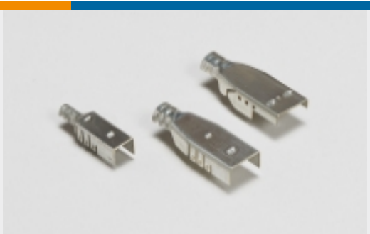
PCB Ferrules & Shields(19)