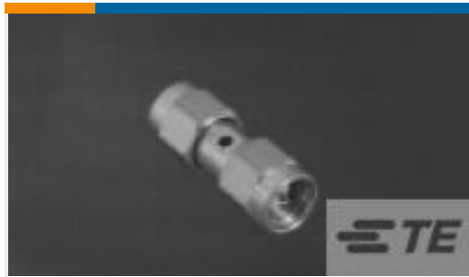
TE Part #1053635-1 2081 0000 02