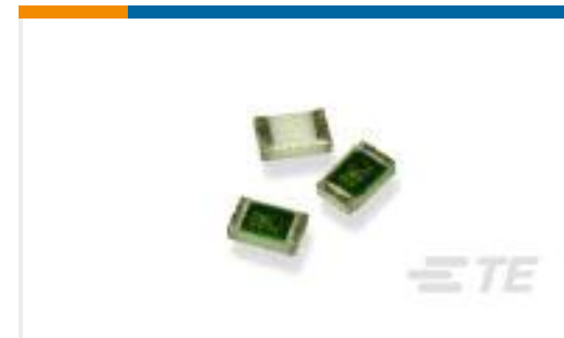
TE Part #7-1676481-3 CPF 0603 6K8 0.1% 25PPM 1K RL