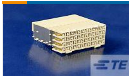
TE Part #6469286-1 HM-ZD 4PR RECP 96P