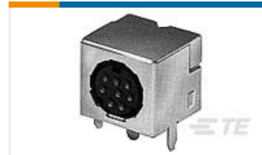
TE Part #5749266-1 Mini DIN, 6 pos, R/A, Shield