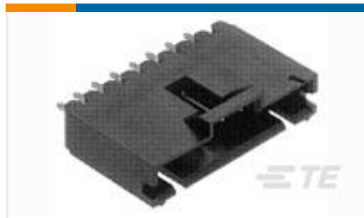
TE Part #5-103908-1 02 MTE HDR SRST LATCH W/HLDWN