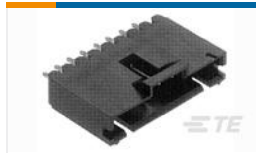
TE Part #5-103908-4 05 MTE HDR SRST LATCH W/HLDWN