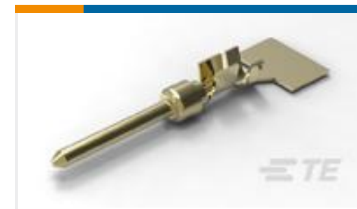
TE Part #66506-9 PIN CONTACT, 20 DF