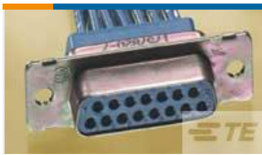
TE Part #207463-1 CRIMP SNAP RCPT ASSY,SZ 3