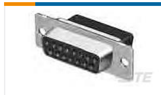
TE Part #205205-2 CRIMP SNAP RCPT ASSY,SIZE 2