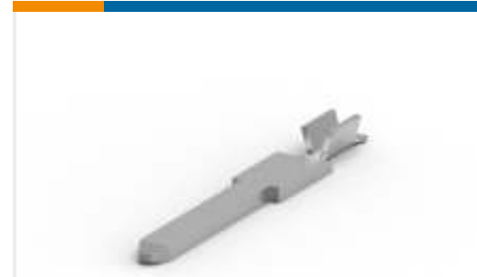
TE Part #184437-4 SENSOR TAB, 1.50 X .80, TIN PL