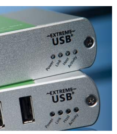
Specifications subject to change without notification. ©2013 Icron Technologies Corp. #90-01097-A01