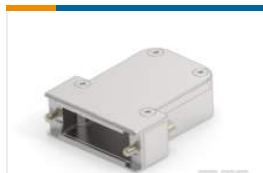
TE Part #1-2308341-1 FULL METAL HOODS SIZE 2