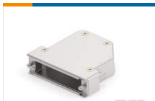
TE Part #1-2308342-3 FULL METAL HOODS SIZE 3-3 (RAW)