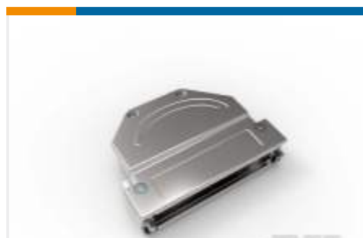
TE Part #1-2308345-3 FULL METAL HOODS SIZE 4 - 3 (RAW)