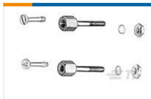
TE Part #5552563-1 HDW KIT, SCR LOCK, VERT MTG