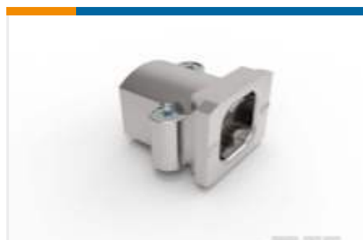
TE Part #1-2308272-5 Cable Clamp for Size 4-5 STD/5QL Shell