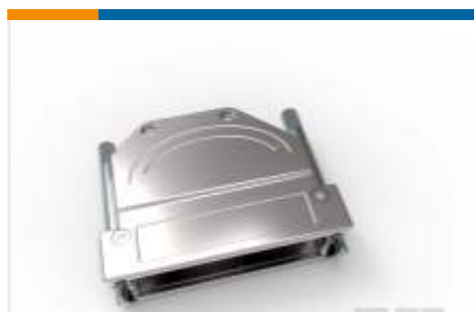
TE Part #1-2308346-6 FULL METAL HOODS SIZE 5 - 6 (RAW)