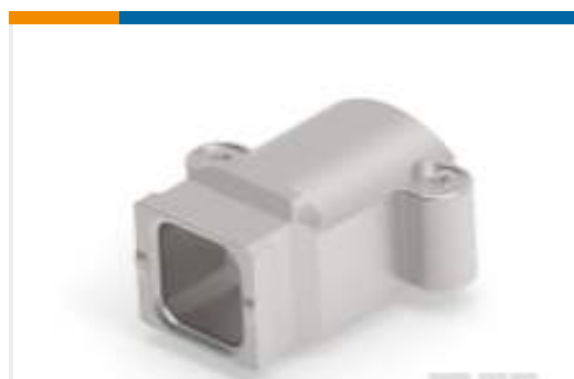
TE Part #1-2308272-4 CABLE CLAMP4 (CASE RAW)