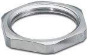
The figure shows version A-INL-M25-N-S

Counter nut, Cable gland material: Nickel-plated brass, Shielding: No, Connecting thread: 3/4 inch NPT, For threads 3/4 inch NPT, Color: silver