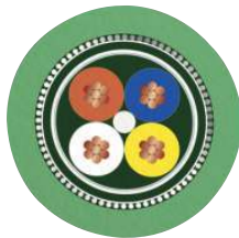
PROFINET PVC stranded CAT5e [93B]